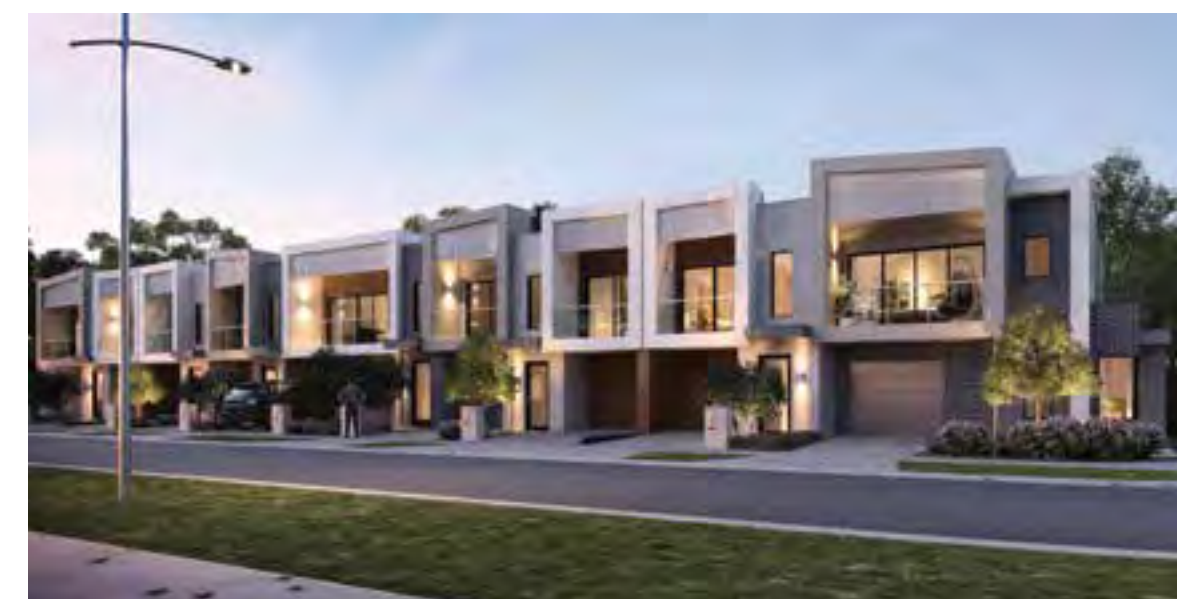
– Left Oxford Town Homes Artist's impression