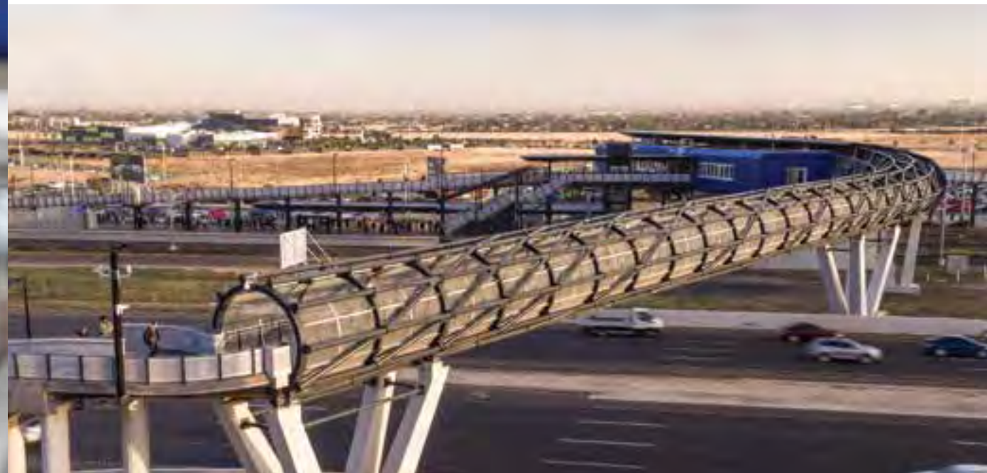
– Above & below Williams Landing Train Station

Private transport is also well catered for, with direct links to the Princes Freeway, Old Geelong Road and Sayers Road.