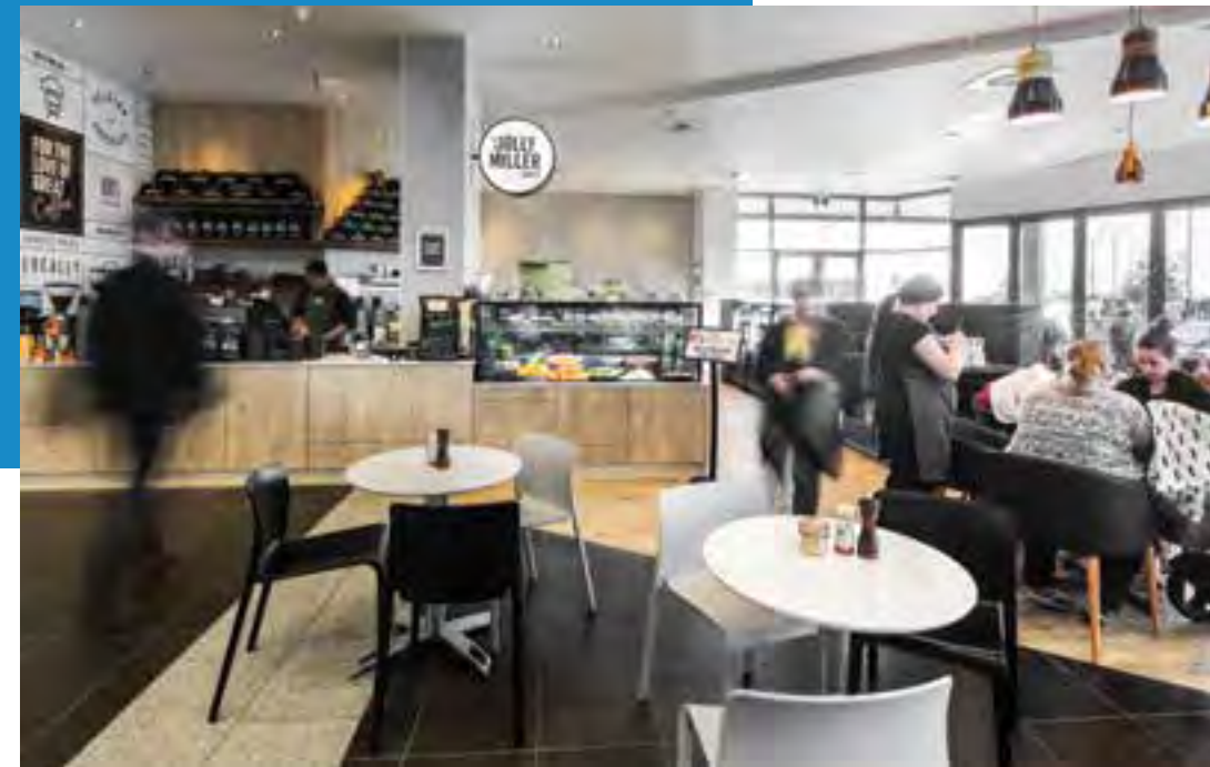
– Below Jolly Miller Café