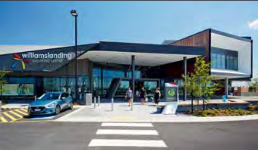
– Above & right Williams Landing Shopping Centre

Anchored by Woolworths and boasting over 25 speciality stores, a premium childcare facility and several licensed family dining options, the retail offering is thriving, with room to accommodate many more retailers in the future.